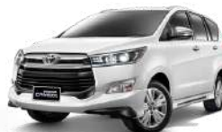
INNOVA / CRYSTA