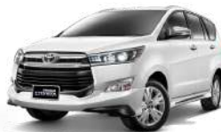
INNOVA / CRYSTA