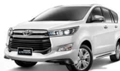
INNOVA / CRYSTA