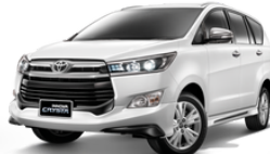
INNOVA / CRYSTA