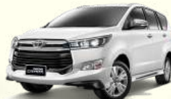
INNOVA / XYLO